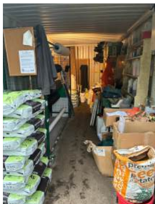
View inside the Trading Hut

One of the key benefits of Bath Allotments Association membership is access to the Trading Hut. In existence for almost 20 years, the Trading Hut is a venture initially co-funded by Bath Allotments Association and Bath Organic Group and is run by volunteers.