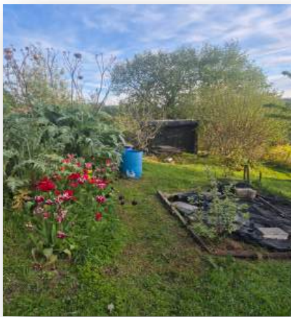
Top: View from Bay Tree Allotments Bottom: One of the Bay Tree plots

Bay Tree Allotment Community Group (BTACG) oversees a private green space that has served the local community for nearly a century. Located between Walcot Parish and the Lambridge boundary, near Hampton View and Bay Tree Road, the site is home to 34 plots of varying sizes and has pleasant views towards Little Solsbury Hill.