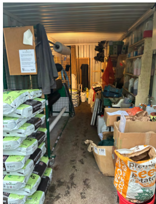
View inside the Trading Hut

One of the key benefits of Bath Allotments Association membership is access to the Trading Hut. In existence for almost 20 years, the Trading Hut is a venture initially co-funded by Bath Allotments Association and Bath Organic Group and is run by volunteers.