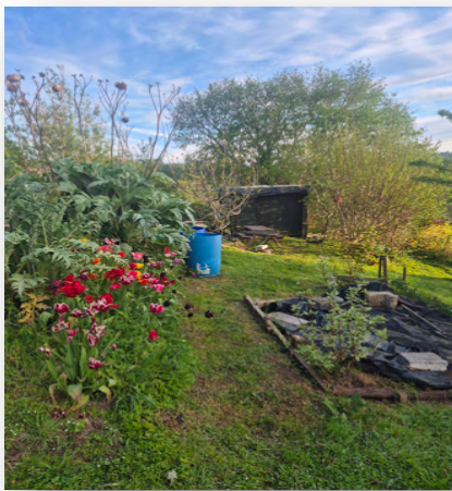
Top: View from Bay Tree Allotments Bottom: One of the Bay Tree plots

Bay Tree Allotment Community Group (BTACG) oversees a private green space that has served the local community for nearly a century. Located between Walcot Parish and the Lambridge boundary, near Hampton View and Bay Tree Road, the site is home to 34 plots of varying sizes and has pleasant views towards Little Solsbury Hill.